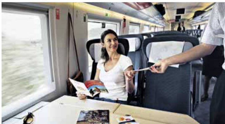
Rides in the high-speed AVE train from Madrid to Barcelona took on a captivating Swiss flavour.

To create the “holiday passport”, which invited guests to discover the colourful Swiss autumn with its glorious natural landscapes and wealth of living traditions, ST produced attractive offers while SBB (Swiss Federal Railways) and the Swiss Association of Public Transport came up with unbeatable prices. The off-season campaign paid off, resulting in the sale of 15,000 holiday passports and 65,000 companion tickets, and generating more than 1,600 direct bookings.