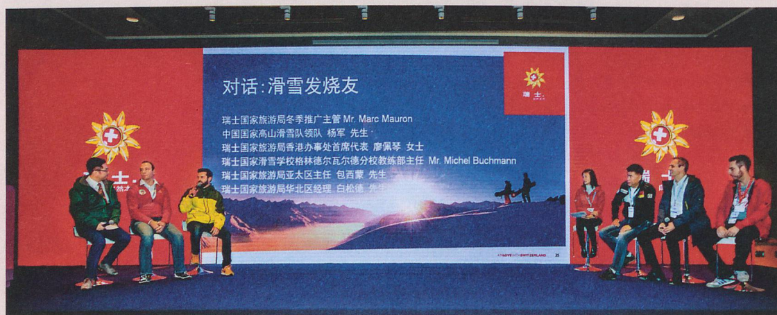
ST presents the Swiss winter at the first World Winter Sports Expo in Beijing.