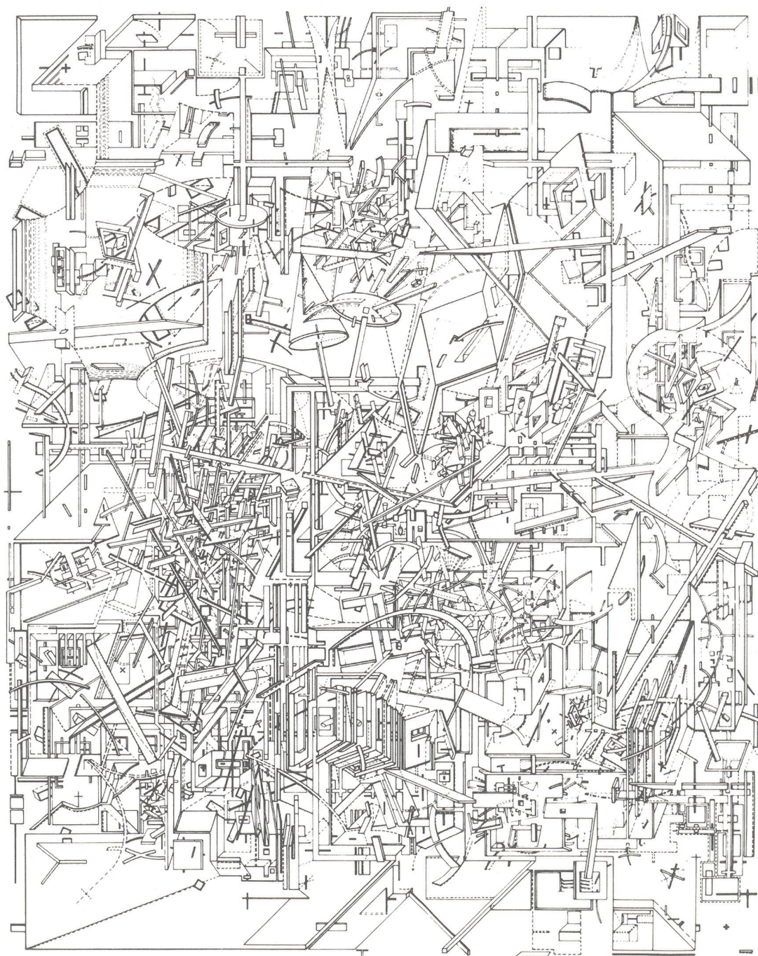
"Molodor's Equation", from: Daniel Libeskind, Micromegas , Exhibition Catalogue, The Museum of Finnish Architecture, Helsinki