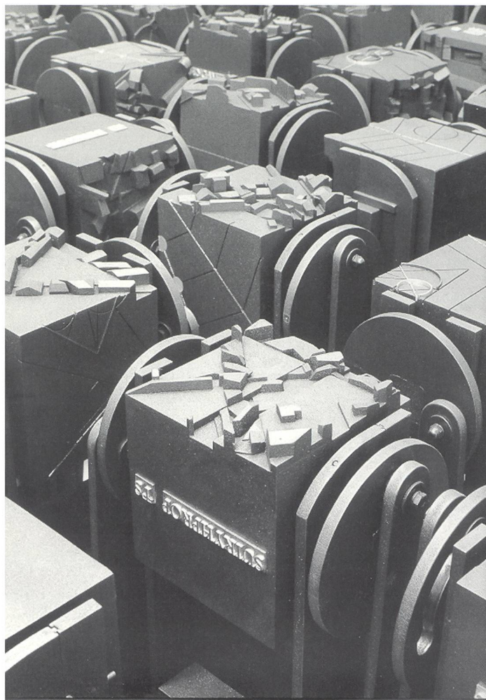
Writing Machine, Venice Biennale 1985; oblique view

between texts. Artificial limits of architectural drawing imprinted on it through orthodoxies of unified representation are questioned here through an overlap of multiple fragments, challenging the reader to search for other coherences. In this manner, drawings mediate between forms tangentially recognizable and imaginative possibilities interpreted by the reader. As “unknown instruments for which usage is yet to be found”, the Micromegas suggest a strategic misuse of language so as to allow readings marginalized by convention. 3 As Libeskind observes, Drawing... is a state of experience in which the other is revealed through mechanisms which provoke and support... these drawings come to resemble an explication of a reading of a text – a text both generous and inexhaustible. 4