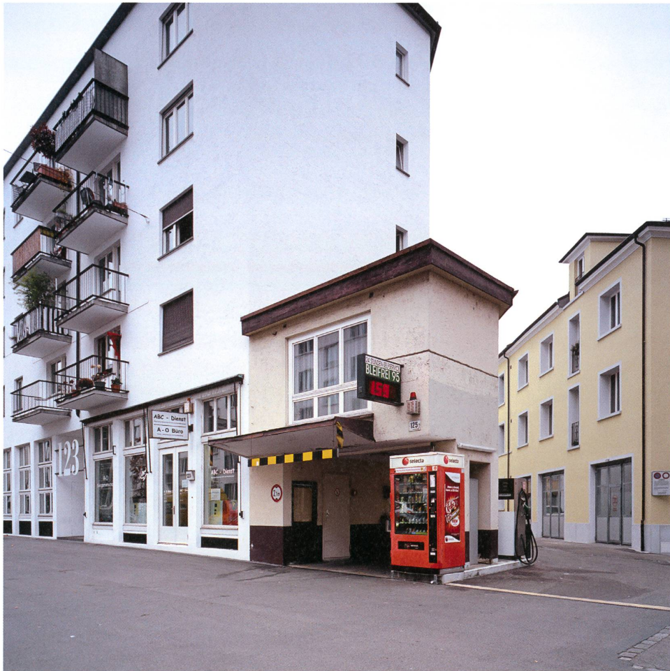
Le petit plaisir de Chiara