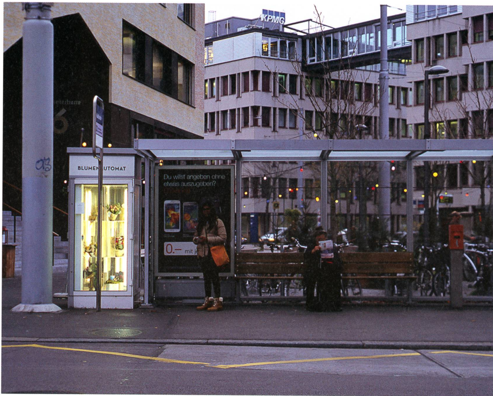
Le petit plaisir de Francesca