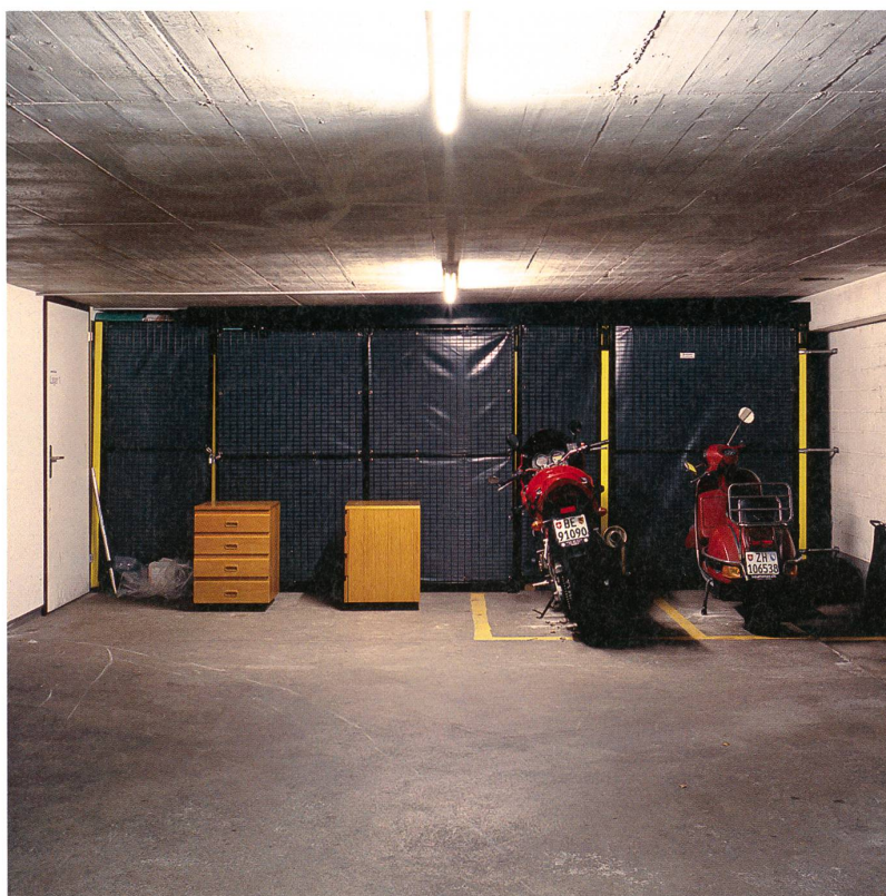
Le petit plaisir d'Anna