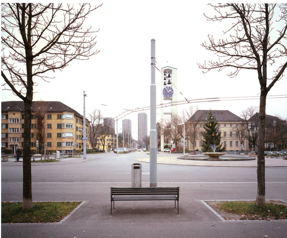
Le petit plaisir de Lorenza