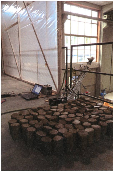
fig. b Early robotic fabrication setup with a laptop, clay projectiles, and a pneumatic cylinder for shooting.