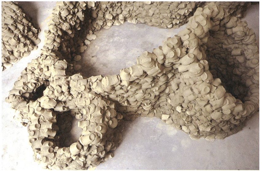
fig. d Detail of the final structure with deformed clay projectiles forming the wall texture.

meaning. Unfired clay was the basis for one of the oldest building modules, the brick. But long before it was used by humans for building shelter and physical structures of power, it was a vital ingredient in formation of life on our planet, as clay minerals only form in the presence of water. When used in construction, this material is mostly shaped from outside by various forming forces, a fact that – like concrete – strengthens our perception of it as an amorphous material. By giving it shape beforehand and then applying a concentrated force (in our case, using it as a ballistic projectile) clay cylinders retain enough of their original shape that certain parameters can be recognised in the finished structure: Their original size, their shape, consistency, direction of flight, the impact force with which they hit the structure. All of this is preserved in the final texture of the surface, telling the story of its own creation as read by a perceptive observer. As Peter Zumthor explains in his book «Architektur Denken» , a building should be able to tell its story without the help of its creator.