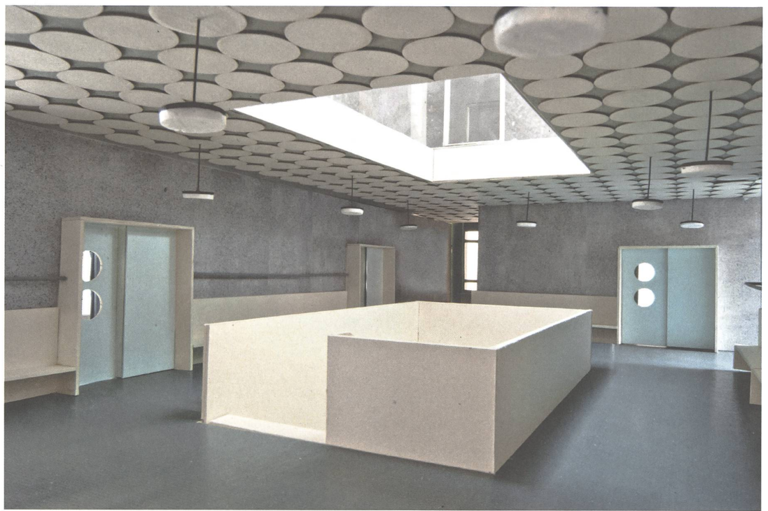
fig. c Model for the School Aemtler