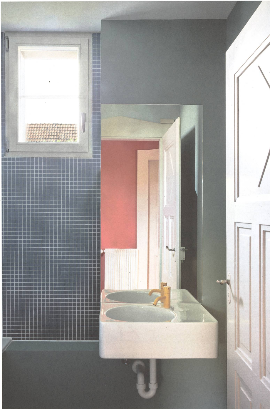
fig. f Haus an der Pestalozzistrasse