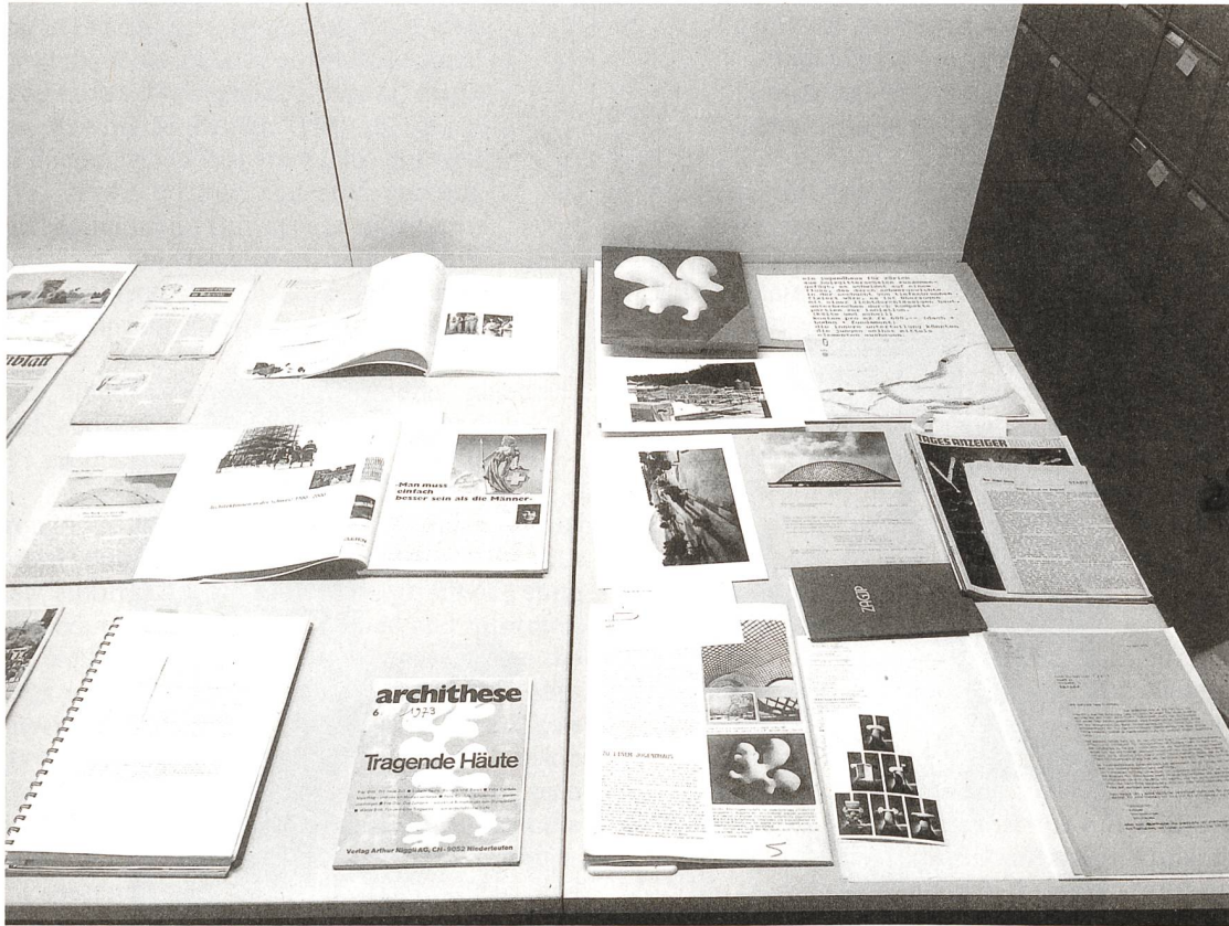
Lisbeth Sachs Archive gta Archiv/ETH Zurich (Nachlass Elisabeth Sachs)