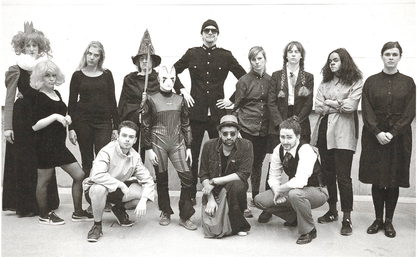
Chillin' Like a Villain, KTH, Stockholm, 2018.