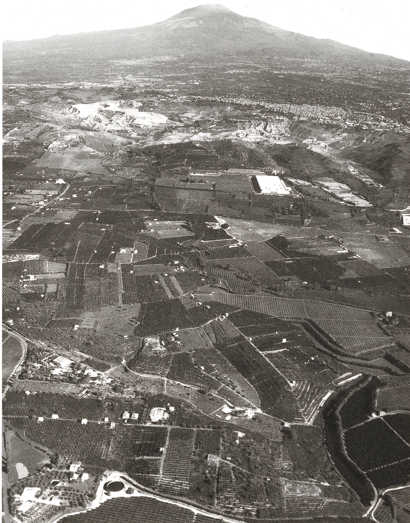
«Landscape of becoming» Mount Etna, Sicily, 2016