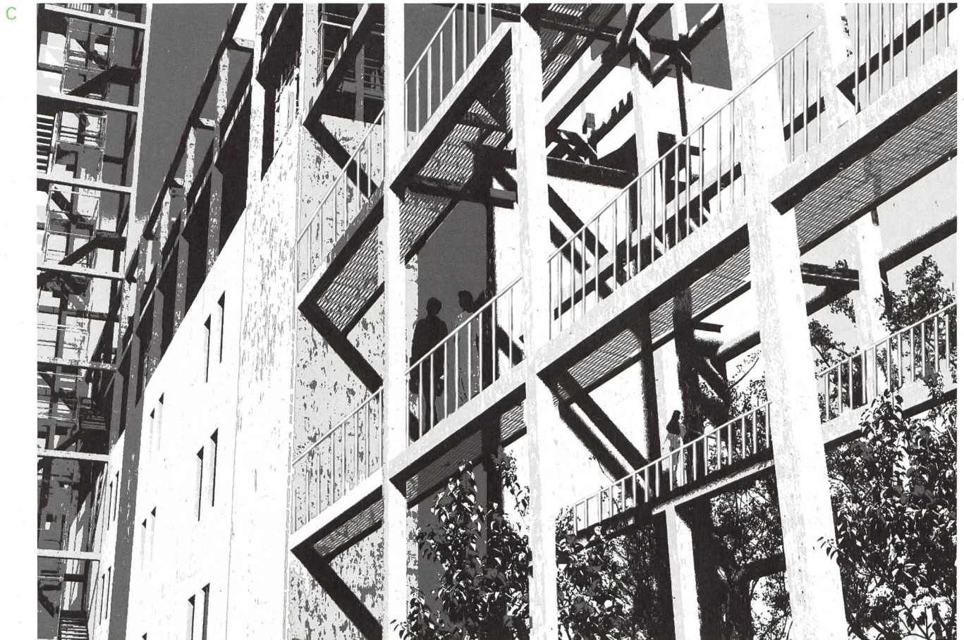
A Protestors passing by Bachoura on their way to Martyr's Square. Photography: Meriam Soltan, 2019 C Proposal for rehabilitation of apartments along Tyane Street. Collage: Meriam Soltan, 2019