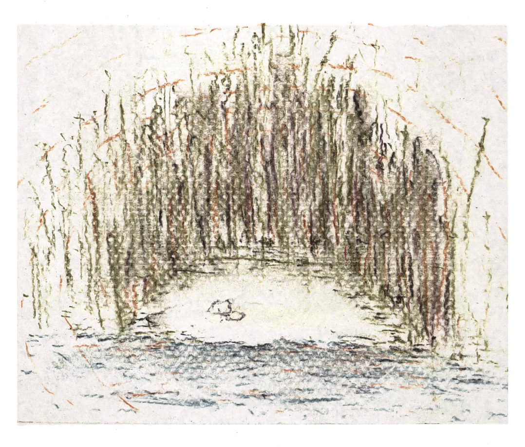
Sketch, 2020.