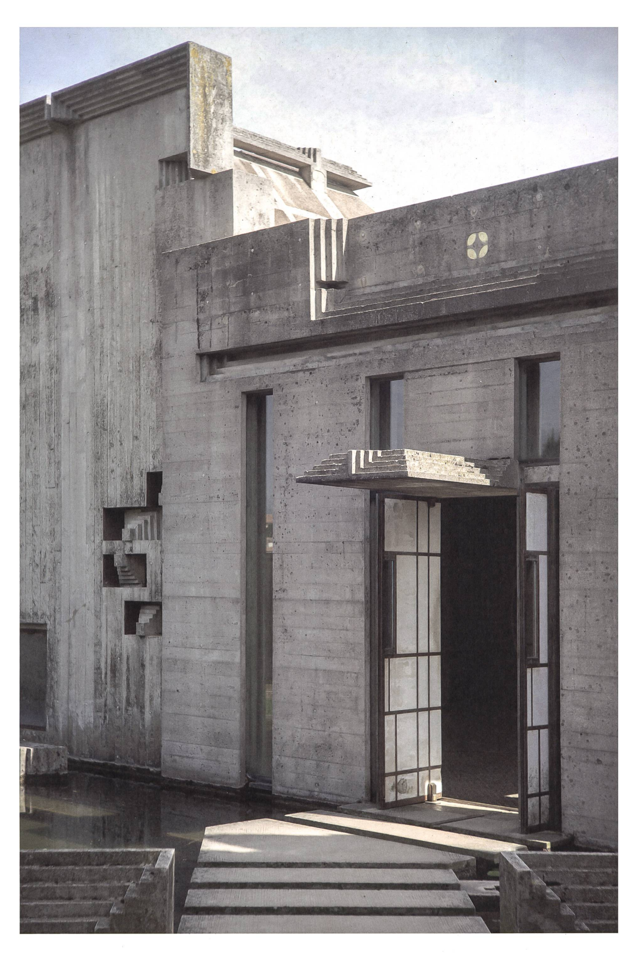
Carlo Scarpa, Brion Tomb, 1968, Pond, Treviso, 2018.