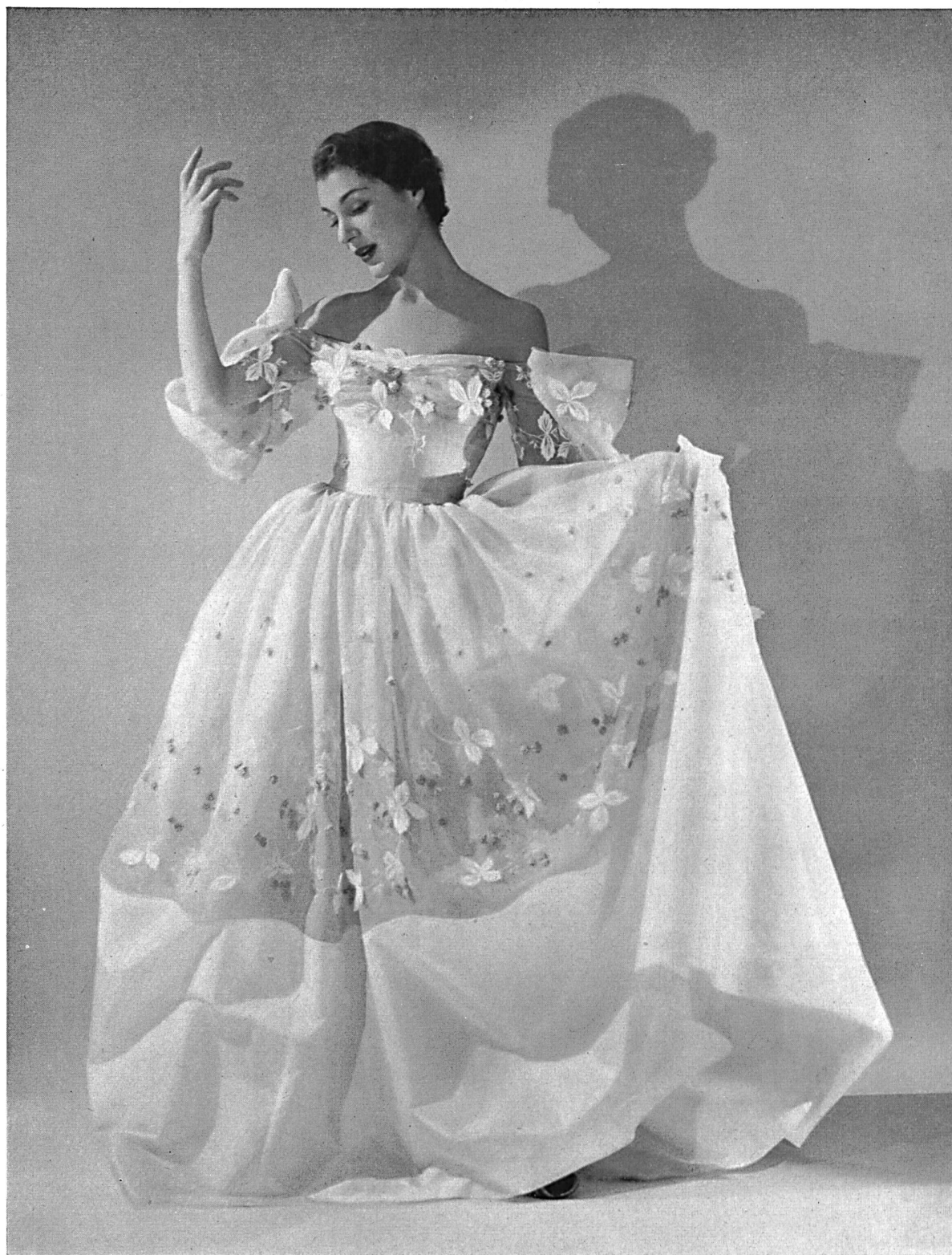
ADRIAN Blue Swiss organdy with white applied flowers and deep taf- feta hem.