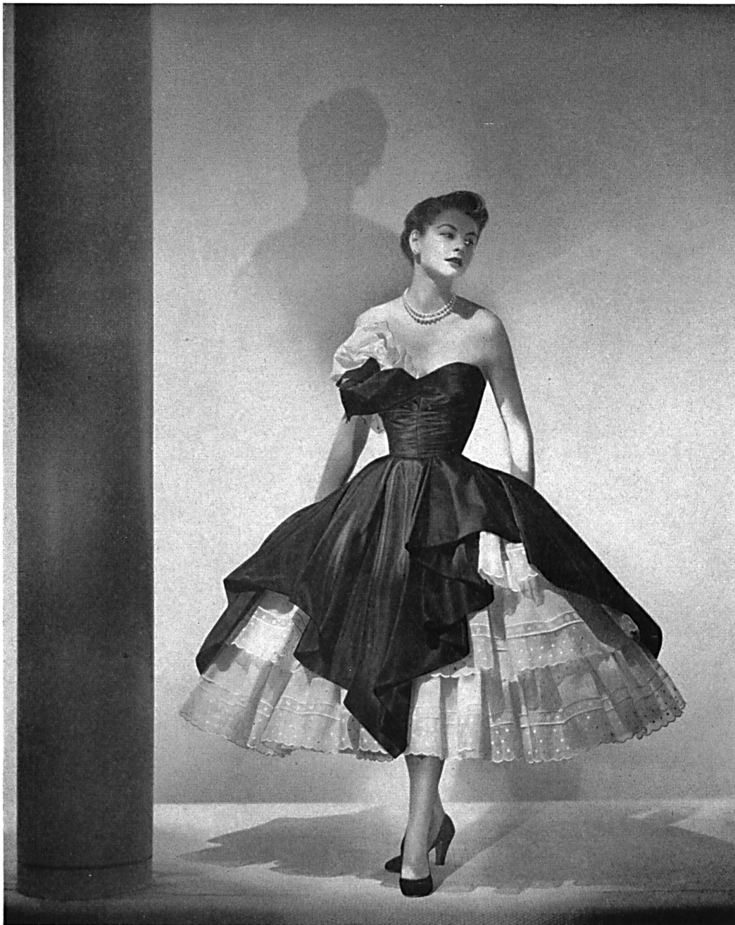
ADRIAN Black taffeta with white Swiss organdy-embroidered underskirt.