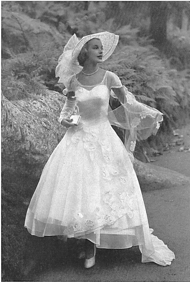
Embroidered organdy with detached flowers by Forster Willi & Co., St-Gall.