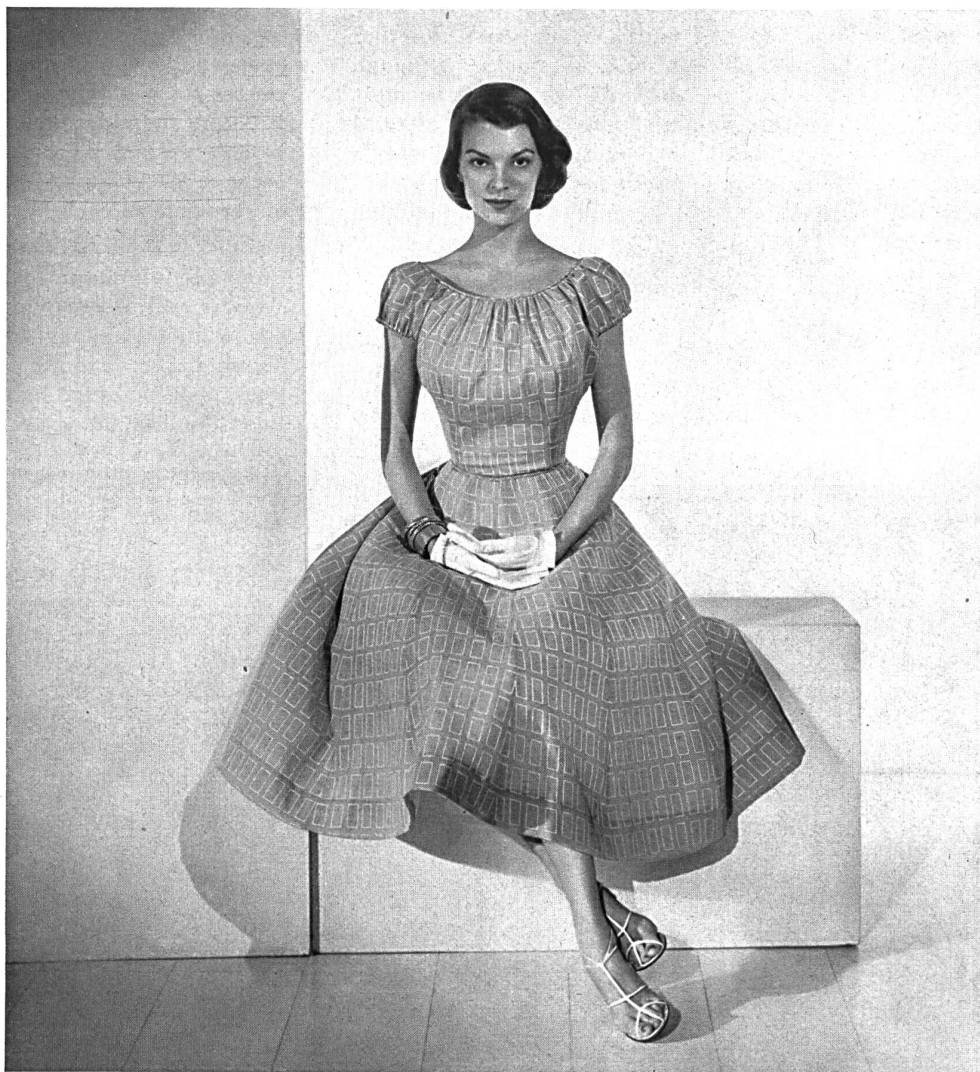
Little-girl dress in anti-creased and sanforized cotton voile, Pat Premo's exclusive fabric by Stoffel & Co., St-Gall.

«It's a perfect dress for a lady»... that is what the buyer of one of the most interesting specialty shops in the country said when they showed her one of the new Pat Premo cottons for summer. And this very accurately