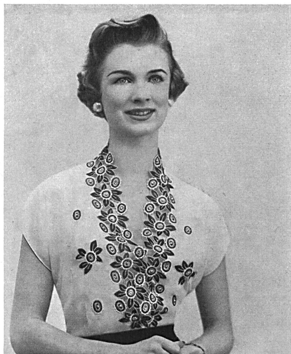
Kates C.L., London

Elegant blouse featuring Swiss washable diamante studded embroidery.