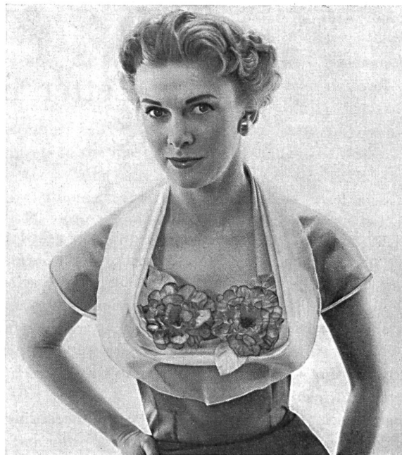
Kates C.L., London

medium price stores are now able to offer lines at suitable prices, their success seems assured partially because of the greater opportunities of travelling and noting quality products and partially because Swiss goods are associated with quality;