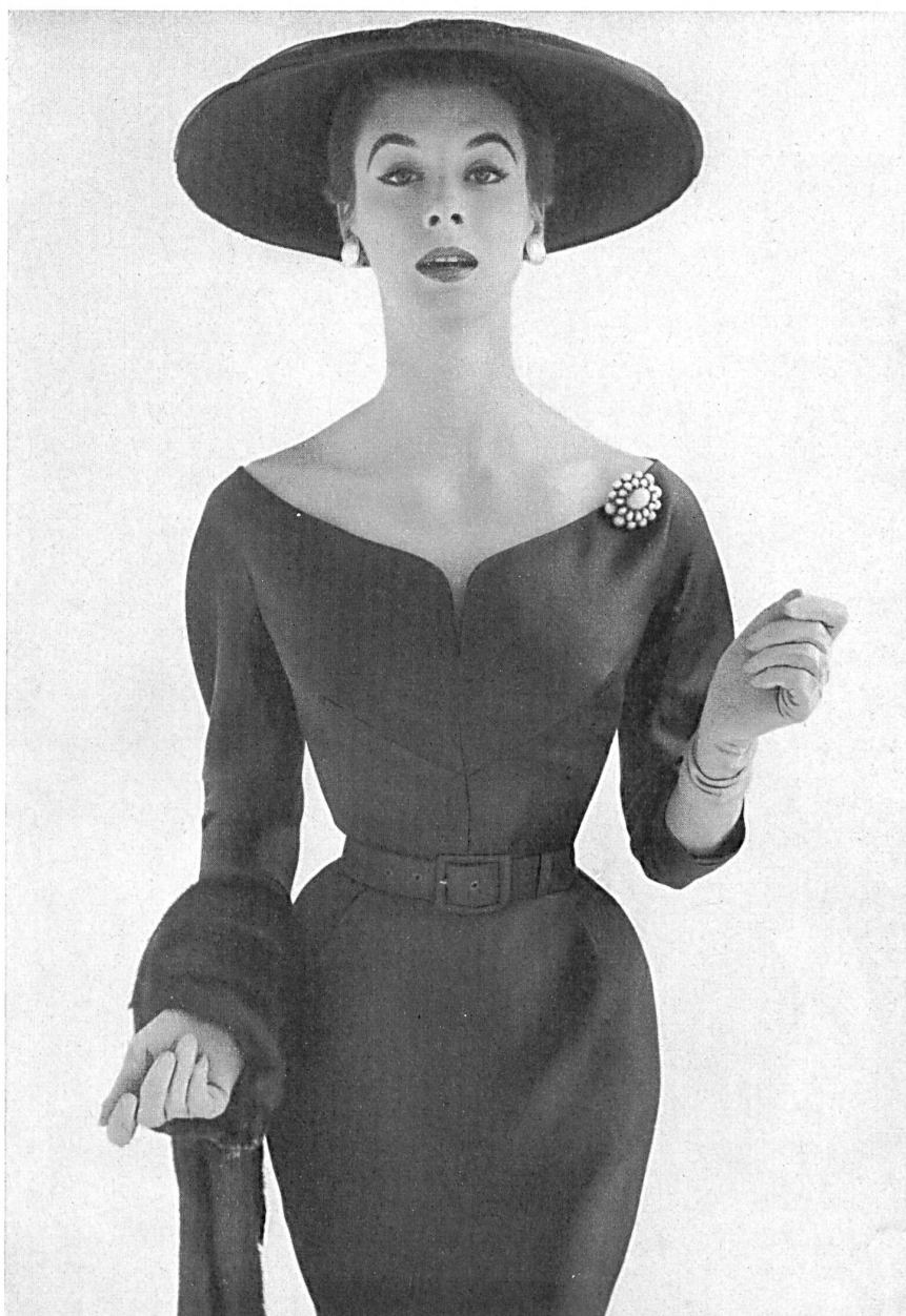
Roter Models Ltd., London

I have in fact just seen a very attractive Brocade by H. Gut & Co. (Zurich), now being used by Rodney Dresses — a Firm well-known for its careful styling and faultless finishing in the more moderately priced garments. In the more expensive ranges several wholesale Couture Houses, such as Roter Models, Roecliff & Chapman, Acquer, Marcus, Susan Small etc. are now regularly using Swiss fabrics.