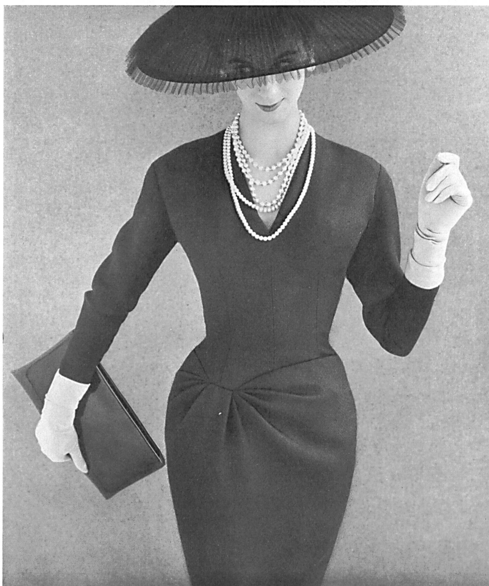
Roter Models Ltd., London

As our social (and private) amenities develop, so our wardrobes usually grow to suit the new circumstances; television has now brought new styles to televise in greater comfort. Though not strictly necessary it should be remembered that the new television fashions are well worth their expense since they will save on wear