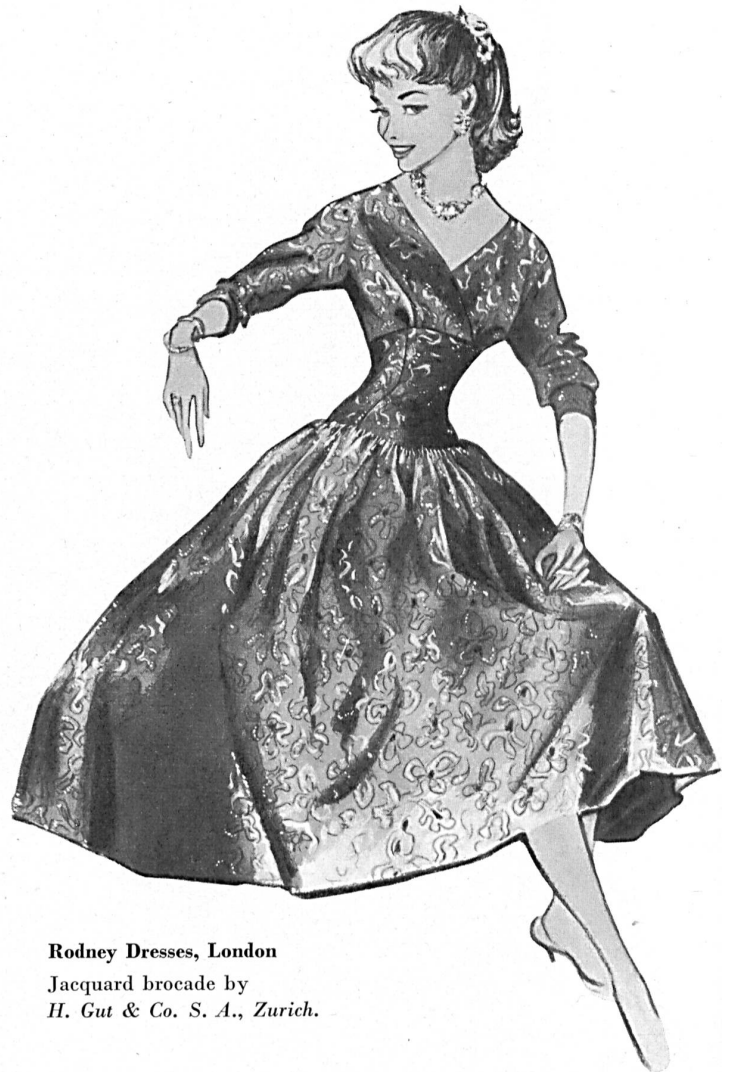
Rodney Dresses, London

The H-line and A-line have quietly merged and with true British compromise given rise to the elegant long-line or long-torso. In some of the English manufacturers' ranges for Summer wear this trend has already become evident but it will be much more pronounced in the forthcoming Autumn Collections.