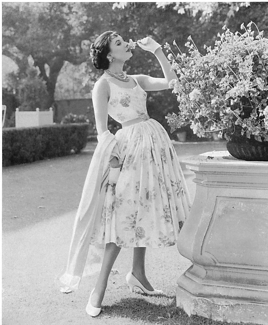
White cotton fabric with pink printed roses.

It all began only 29 years ago when James Galanos was born in Philadelphia. Born of Greek parents, he