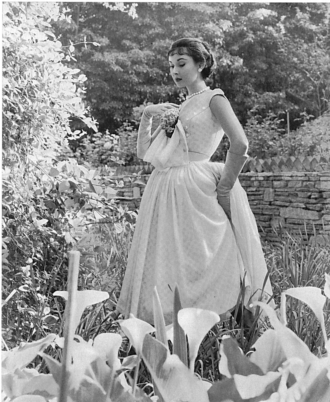
Blue check patterned cotton voile.

lived in small New Jersey and Pennsylvania towns until he left home at the age of 18 to work at "pushing fabrics around and picking up ins" in the famous salon of Hattie Carnegie. It was here he realized that his strong interests lay, and during his very simple apprenticeship he studied design in art school, learned the technique of draping and cutting, and being talented, sold sketches to various New York dress houses.