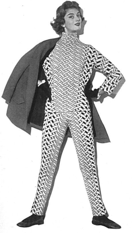
After-ski outfit in black and grey Jacquard jersey, with jacket in cherry colored jersey lined with black.

The experience having proved a success, it will doubtless be repeated, but in less haste next time. Meanwhile let us congratulate the promoters and organisers of this fashion show as well as the Swiss manufacturers of dresses, coats, suits, knitwear, footwear, hats, etc. who contributed to the outstanding success of the occasion.