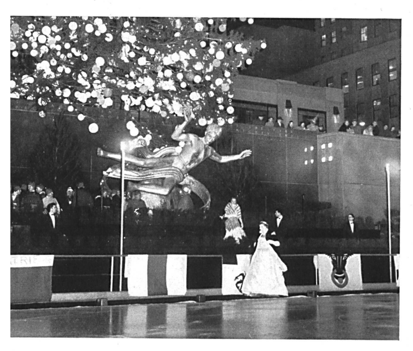
The open air showing, at the foot of the illuminated Christmas tree, in front of the ice-rink at the Rockefeller Center.

Switzerland is well known in the United States for her cheese, chocolate, watches, beautiful scenery and good hotels. With regard to textiles, certain specialities are already quite well known but, for one reason or another, her women's ready-to-wear clothing does not enjoy the same renown. That is why the Swiss Travel Office in New York had the idea of showing Americans a different side of Switzerland for a change, taking advantage of the winter season to give this fashion show a slightly touristic flavour. The Exporters Association of the Swiss Clothing Industry leapt at the idea and feverishly set to work even though it was a well-nigh impossible task to hope to put on in three short weeks a show intended to attract and startle the sophisticated people of New York, who were all very busy doing their last-minute Christmas shopping in an unprecedented spending spree. The task was made even more difficult by the fact that it was necessary to try and capture the attention of the fashion reporters who are notoriously even more blasé than the general run of the population. The culminating difficulty was the fact that the organisers had decided to hold the show at the ice-rink of the