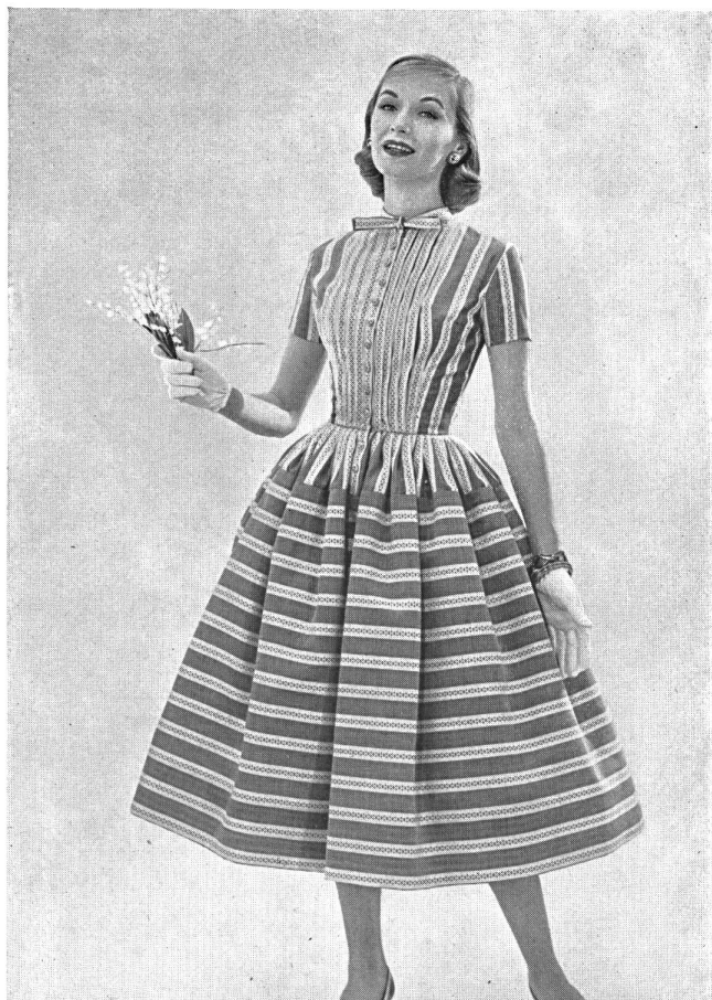
REICHENBACH & Co., SAINT-GALL