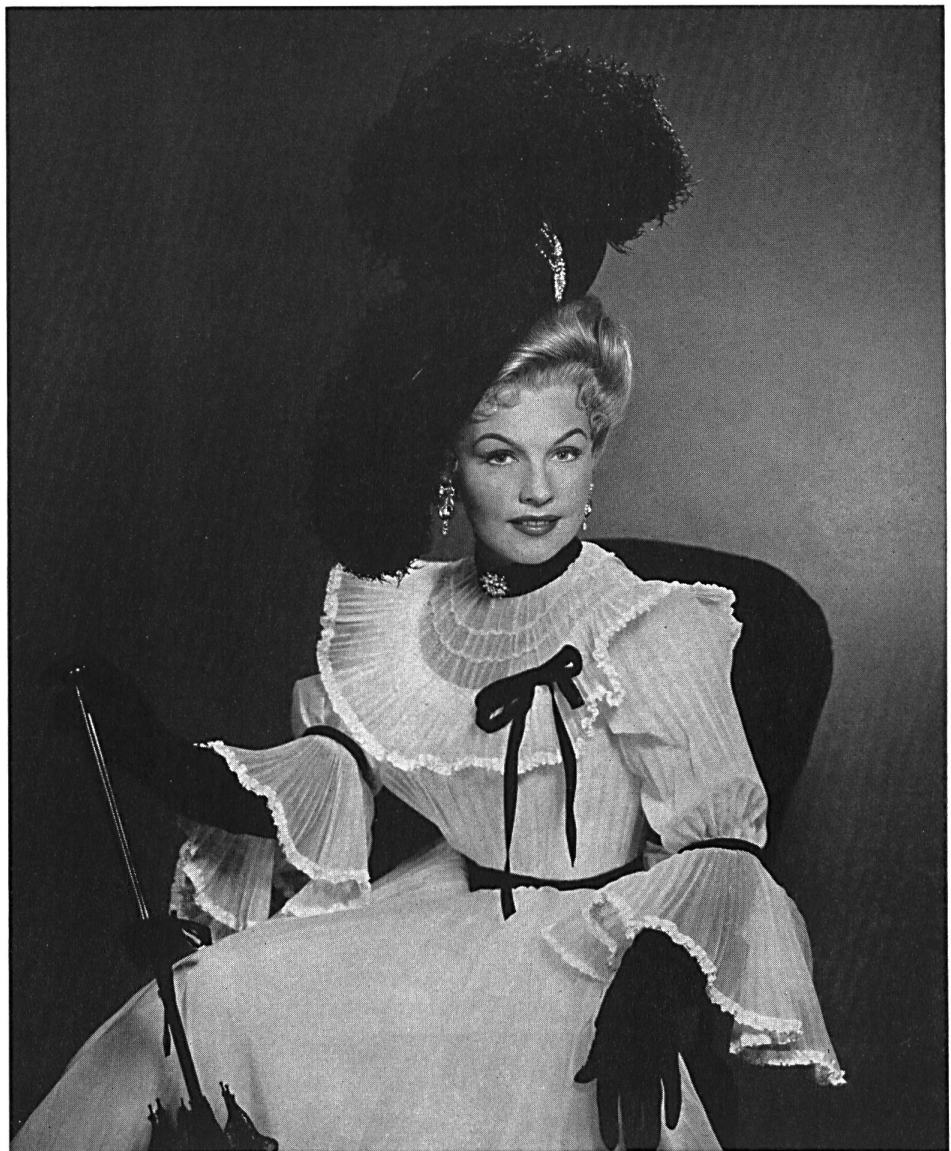
STOFFEL & Co., SAINT-GALL

Extraordinary care must also be exercised lest a gown be an anachronism, a deterrent to the action of a picture or a distraction to the viewers leading interest away from