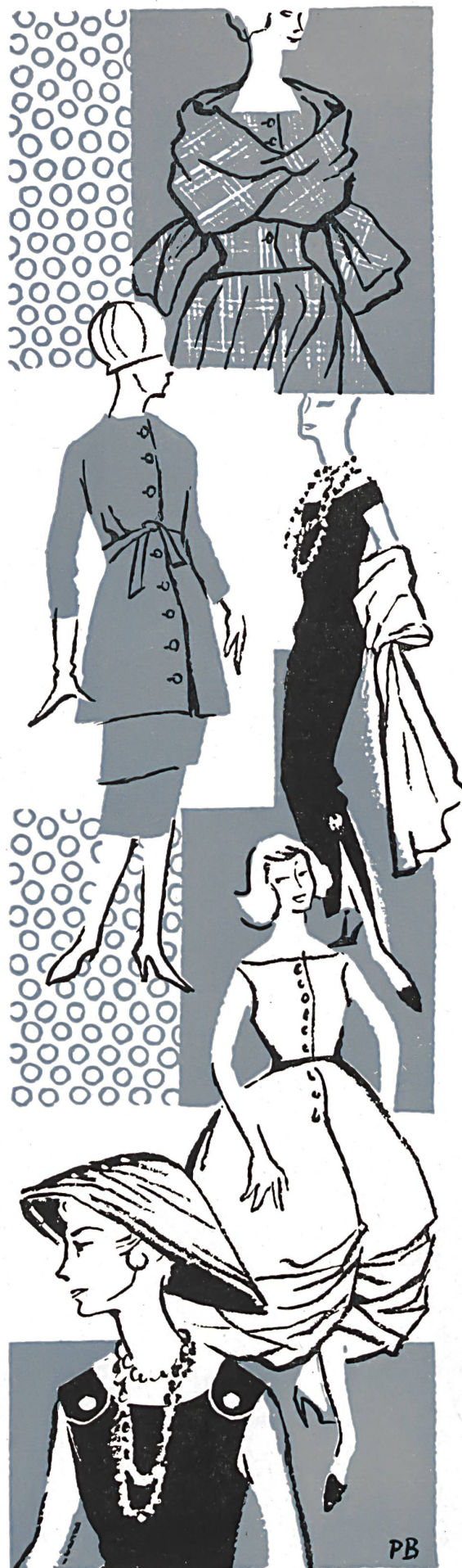
Détails, de haut en bas — Carven: deux-pièces Prince de Galles avec écharpe de même tissu ; Jacques Heim : deux-pièces en lainage beige ; Christian Dior : robe du soir en crêpe, demi longueur, fendue et retenue par un bijou aux genoux, écharpe de même tissu ; Guy Laroche : robe bulle en mousseline imprimée retenue devant ; Christian Dior : robe de cocktail.

But apart from these minor criticisms of details, which are an instinctive reaction against the unusual, there is everything to rave about. To quote at random: the diversity of the skirts; straight, pleated, full, billowing, bell shaped, sometimes with panels, often uneven — skirts for all tastes and all shapes. Let us add that as a general rule they are a little shorter than last season.