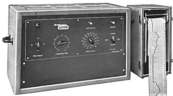
Spectrograph attachment for analysing the yarn readings given by the « Uster » Evenness Tester.

In a previous article (see Textiles Suisses No. 1/1957, page 100) we stressed the importance of the testing of materials for the maintenance and improvement of quality in the textile industry. We should like to complete the previous article by describing certain practical examples, which will enable the layman to form a better idea of the value of this research.