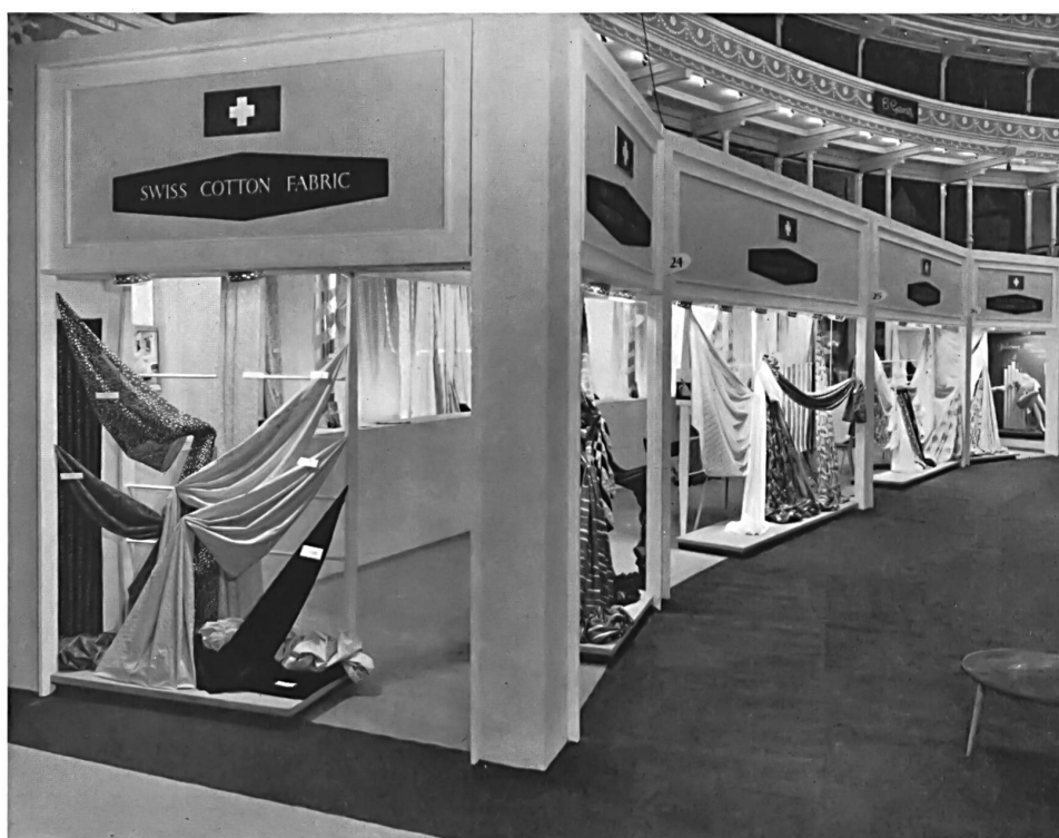
Stand of the Swiss Cotton and Embroidery Industry at the First International Trade Fashion Fair, London (November 18-22, 1957).