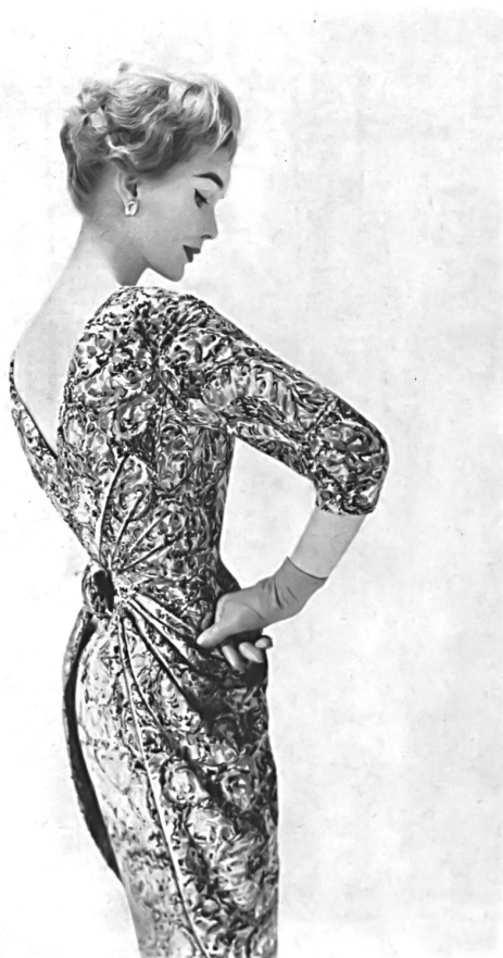
NABHOLZ S. A., SCHÖNENWERD