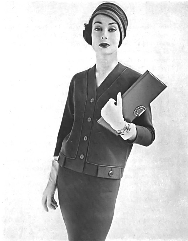
KRÄHENBÜHL & Co., CLARENS-MONTREUX « EGEKA »

Wir bringen auf dieser und auf der folgenden Seite die neuesten Modelle der Schweizer Maschenindustrie, um die aktuellen Tendenzen dieses Industriezweiges, welche im vorhergehenden Aufsatz erläutert wurden, besser zu veranschaulichen.