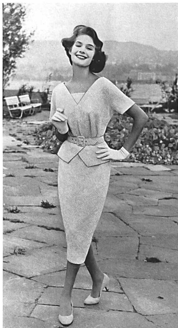
HIS & Cie S. A., MURGENTHAL « HISCO »