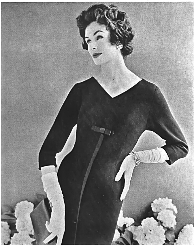
KRÄHENBÜHL & Co., CLARENS-MONTREUX « ECEKA »