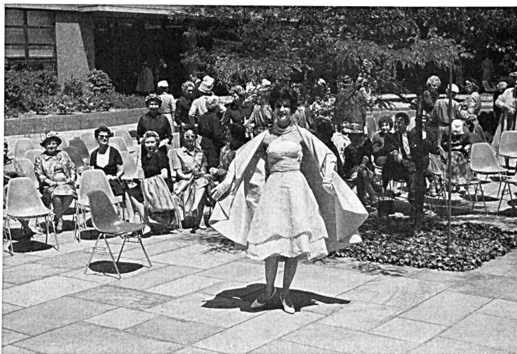
Embroidered organdie Organdi brodé Modèle Pauline Trigère, New York