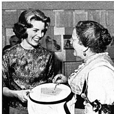
En conversation avec une brodeuse appenzelloise. Chatting with an Appenzell embroiderer. Charlando con una bordadora de Appenzell. Im Gespräch mit einer Appenzeller Handstickerin.