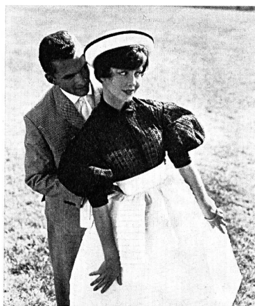
UNION S. A., SAINT-GALL

St. Gall always combines its great sporting event of the year with the presentation of the loveliest creations of its