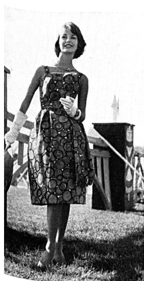
METTLER & CIE S. A., SAINT-GALL

Organdie with chenille embroidery Modèle Gack, Zurich