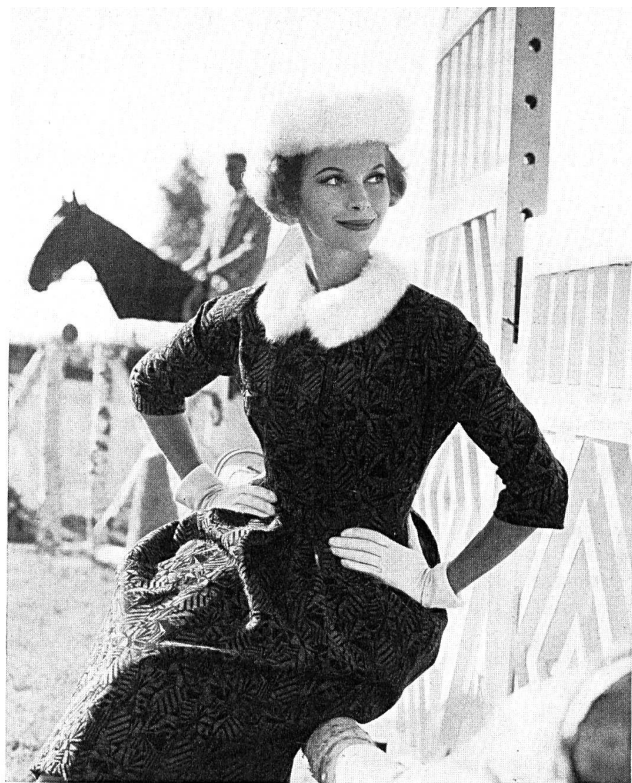
STOFFEL & CO., SAINT-GALL