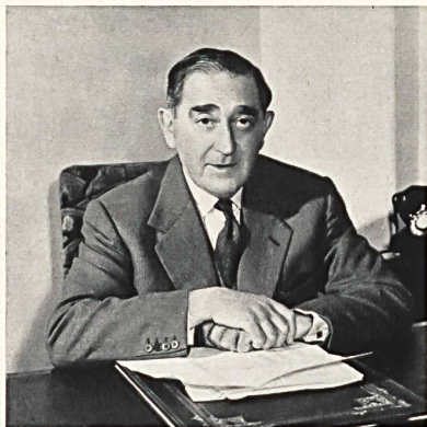
Sir Simon Marks, the brain and the power behind Marks & Spencer

With Swiss cottons continuing to hold their own, despite the great advent of synthetics into the world markets, this might be a good time to examine the great strength of a great store, some idea of whose size and buying power can be gained from the fact that during the first half of this year it bought over 12 million yards of embroidered trimmings and novelties.