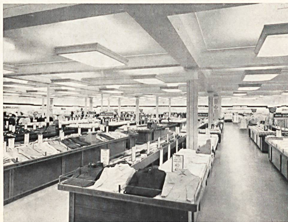
A view inside the shop