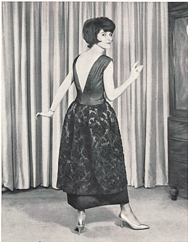
Modèle Mattli, London