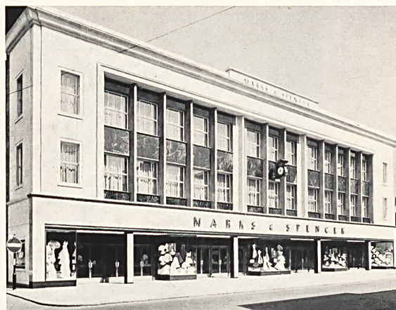
One of Marks & Spencer's Department Stores, London