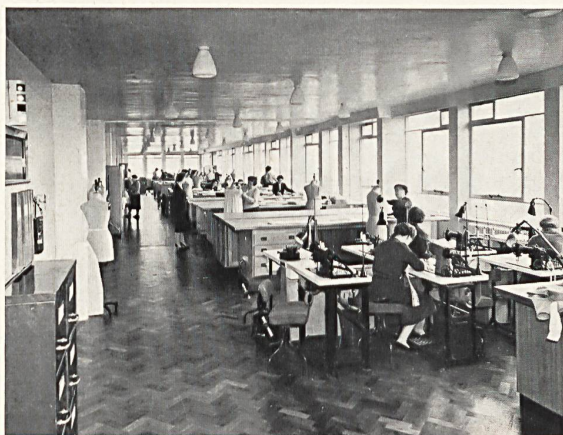
In the cutting rooms