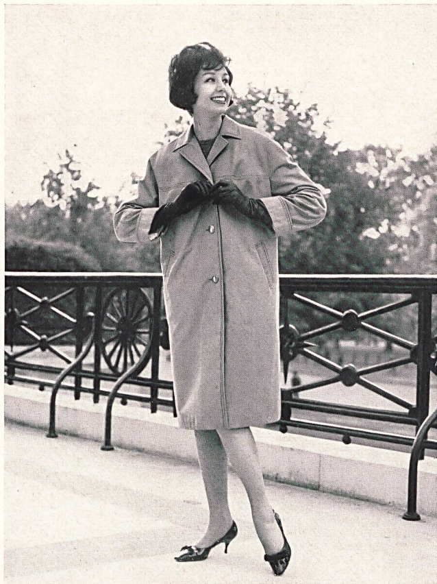
Manteau de pluie en tissu de coton suisse hydrofugé Raincoat made of Swiss water repellent cotton fabric Abrigo de lluvia en tejido algodón hidrofugado suizo Regenmantel aus schweizerischem impräniertem Baumwollgewebe