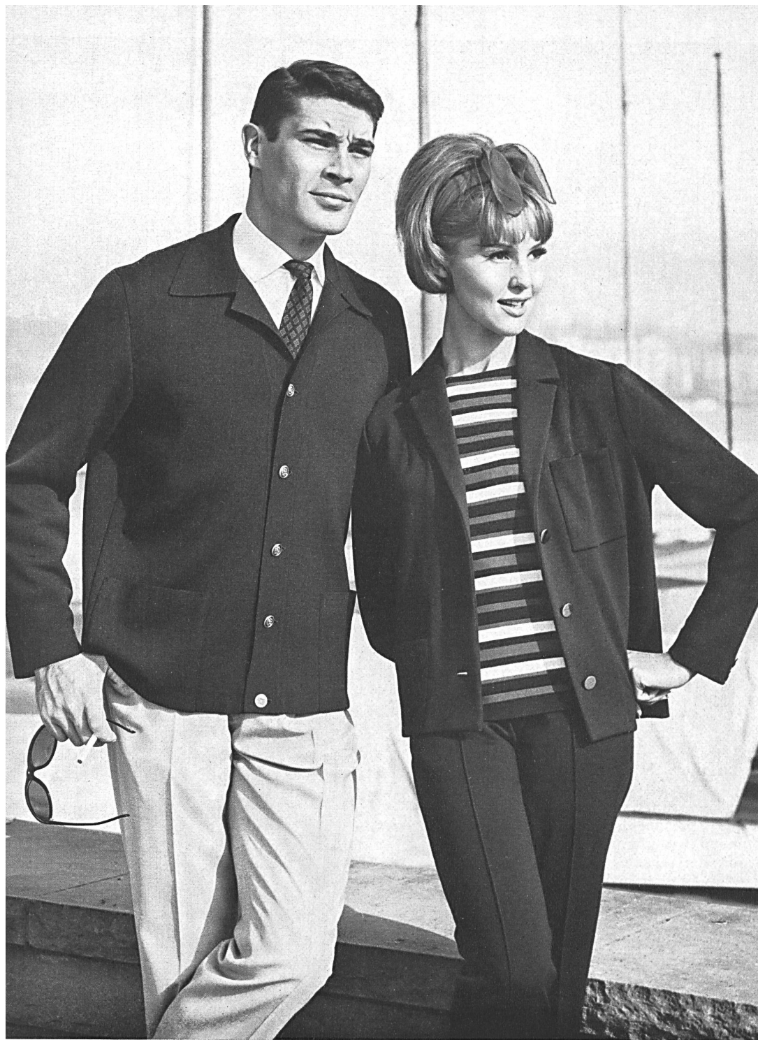
Smart blazer for men. Attractive pure wool knitted outfit for women: blazer, fancy striped pullover and slacks

Walking through this big factory, one sees a great many knitting machines of recent make, some of which are even electronically controlled. This variety of circular and flatbed machines as well as others for knitting fully fashioned articles enables the firm to adapt its production quickly to keep up with the often rapid changes in fashion. These machines, with their wide range of possibilities, can produce plain or Jacquard articles as required.