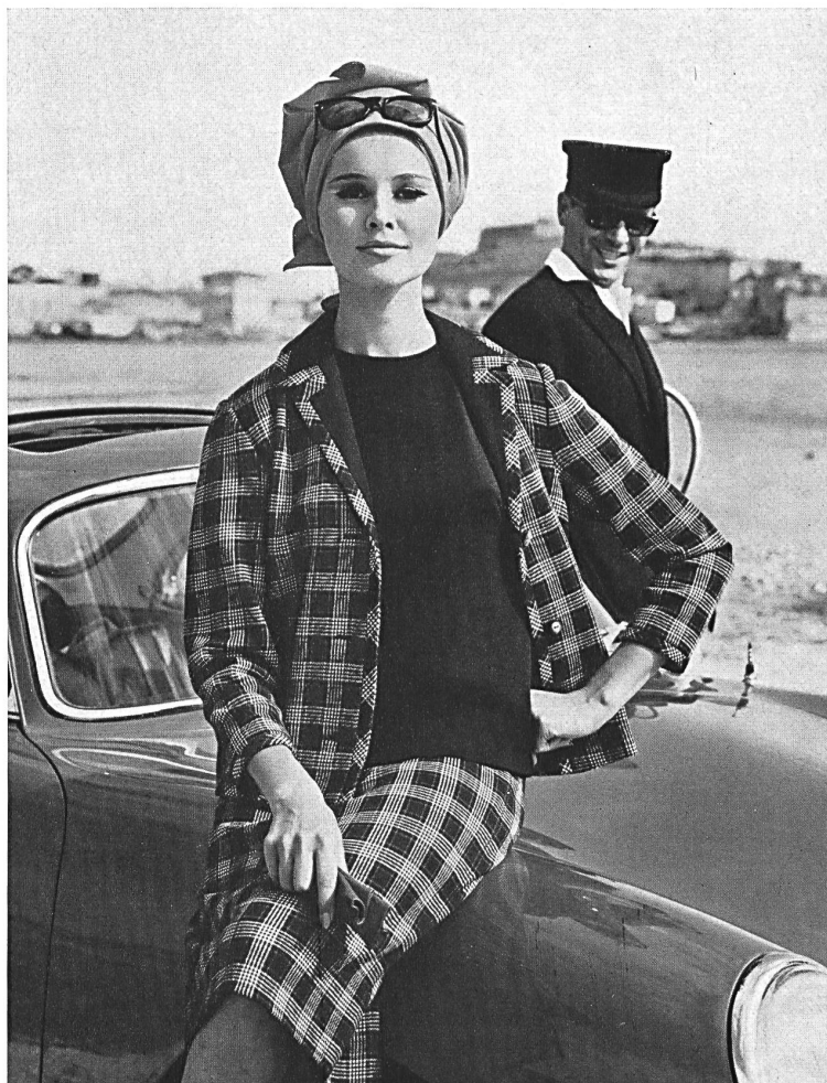
Three-piece outfit with skirt and jacket in pure wool Wevenit

The manufacture of high quality knitwear calls for other requirements, such as fulling, which gives woollen knitted articles great softness of touch, but also, and above all, the careful selection of the appropriate knitting machines.