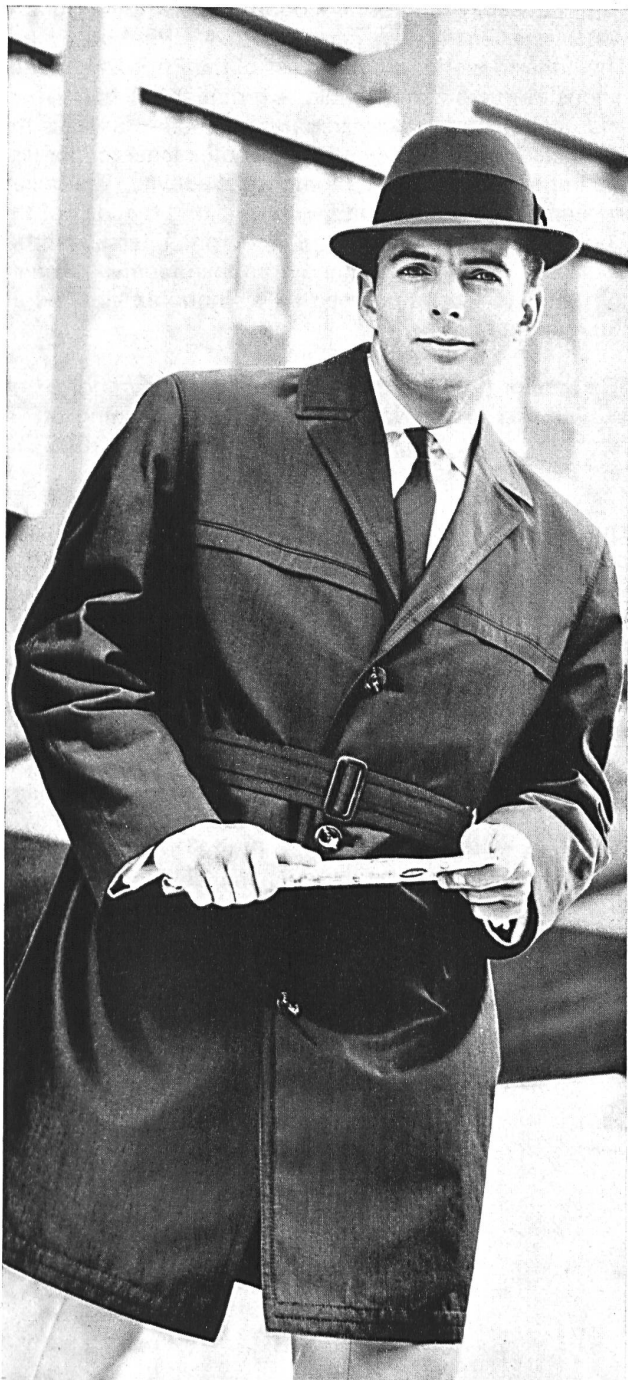
Man's raincoat made from 100% cotton with a Phobotex finish.