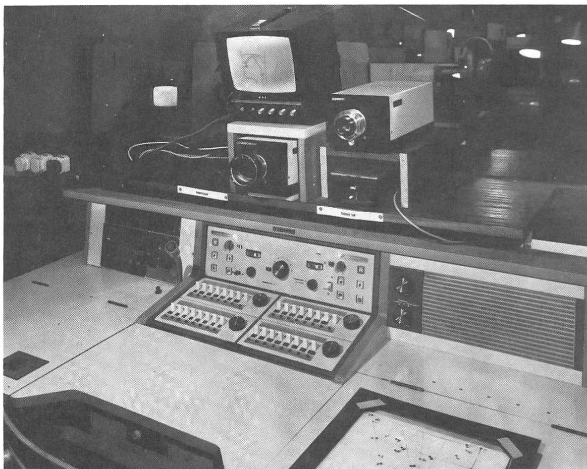
Figure 3: The teacher controls the broadcast recorded material, and can supplement it with live instruction