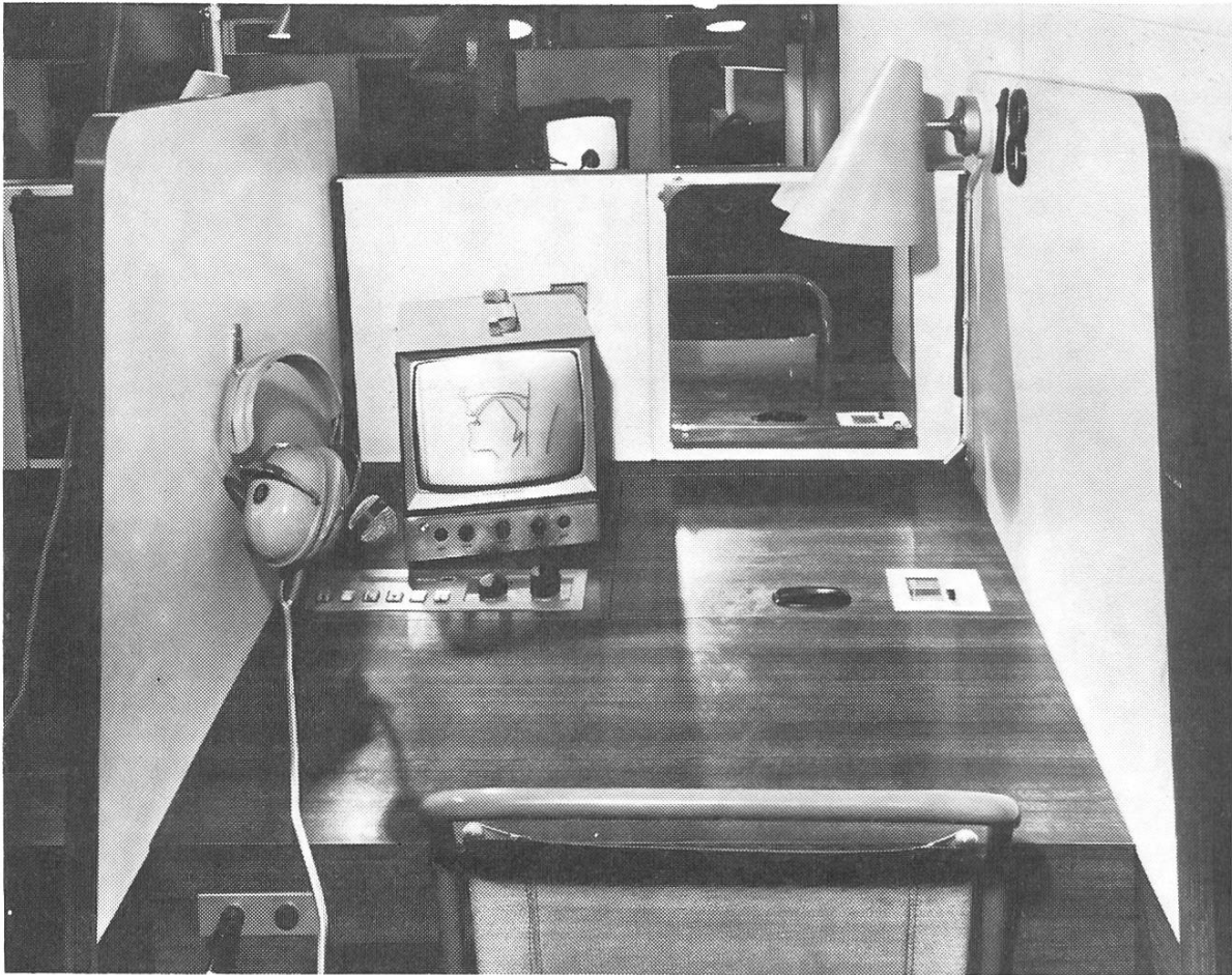
Figure 1: A student position in the development and 'teaching' laboratory