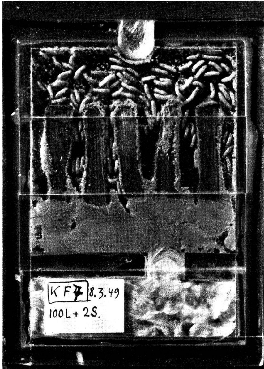
Fig. 2. Photograph of a flat nest 4 weeks after installation of a colony of Kaloterмес flavicollis

termopsis . The nest is now ready to receive the termites which have been transferred from the wood or soil into a small dish some hours before. The termites have to be handled gently, and carefully selected. Only perfectly healthy and active specimens are placed into the nest chamber. In order to have functional supplementary reproductives within a short time, not less than 30 individuals of Zootermopsis angusticollis , 50 of Kaloterмес flavicollis or 100 of Reticulitermes lucifugus should be installed in one nest. After the termites have been brought into the nest, their chamber is covered with three 76 \times 26 mm. ( 3 \times 1 in.) microscope slides fixed to the nest provisionally with clamps made of hairpins (see Fig. 1). The smaller chamber is filled with moistened cotton wool. The water will then be drawn by capillarity through the glass wool into the sand of the nest chamber. The water-supply chamber is then also covered with a microscope slide. All cracks between the microscope slides and the nest are now waterproofed with paraffin wax and the clamps are removed.