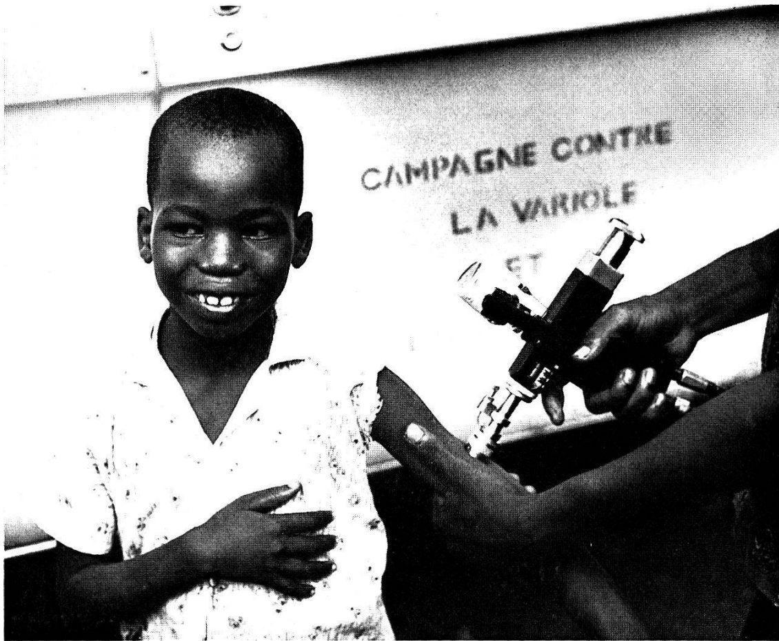
The Ped-O-Jet model automatic jet injector.