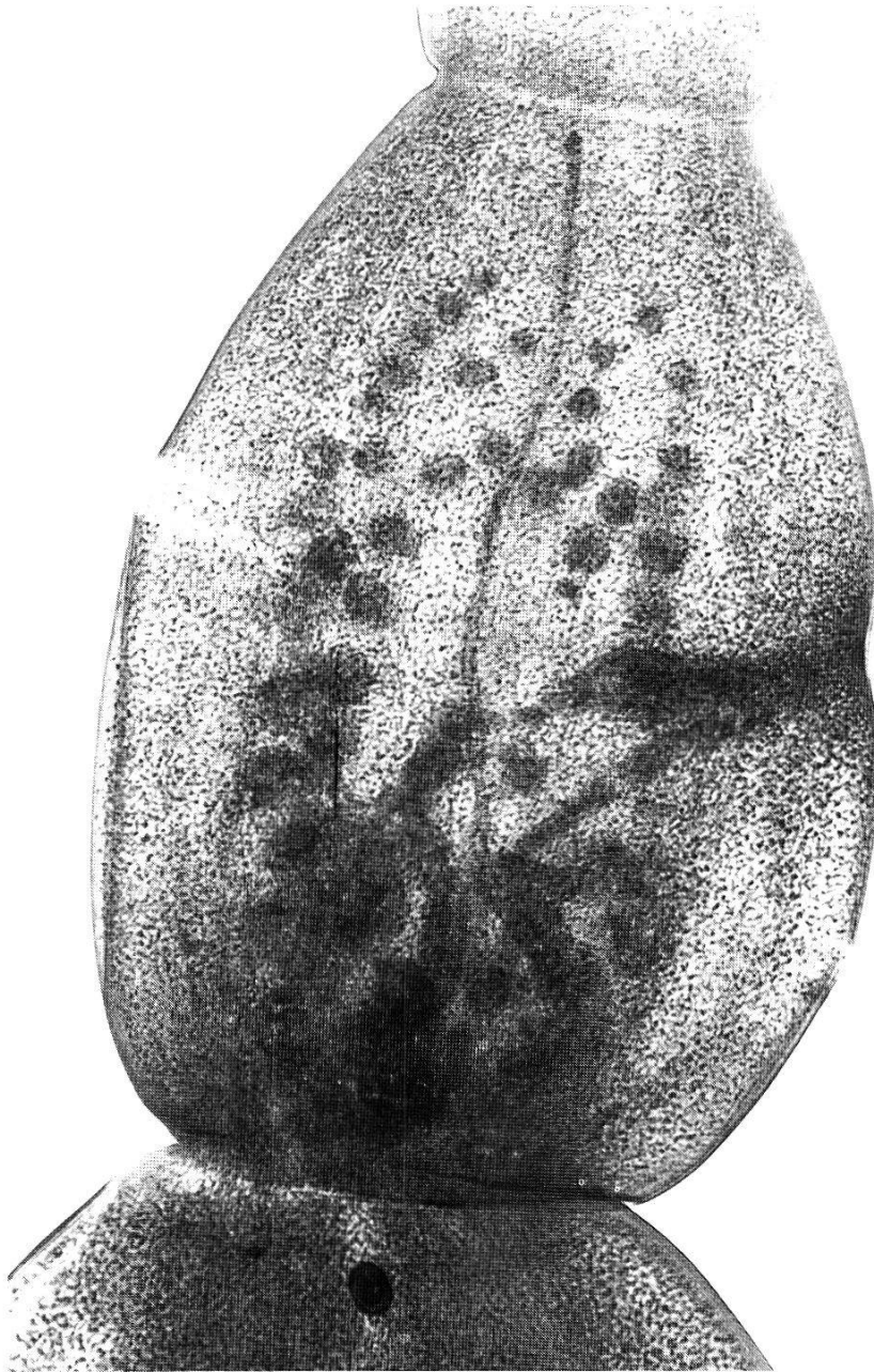
Fig. 2. Mature segment of E. granulosus of sheep-dog origin showing male and female genitalia, \times 60 .

3 months after feeding when the cats were autopsied no worm could be found in the intestine.