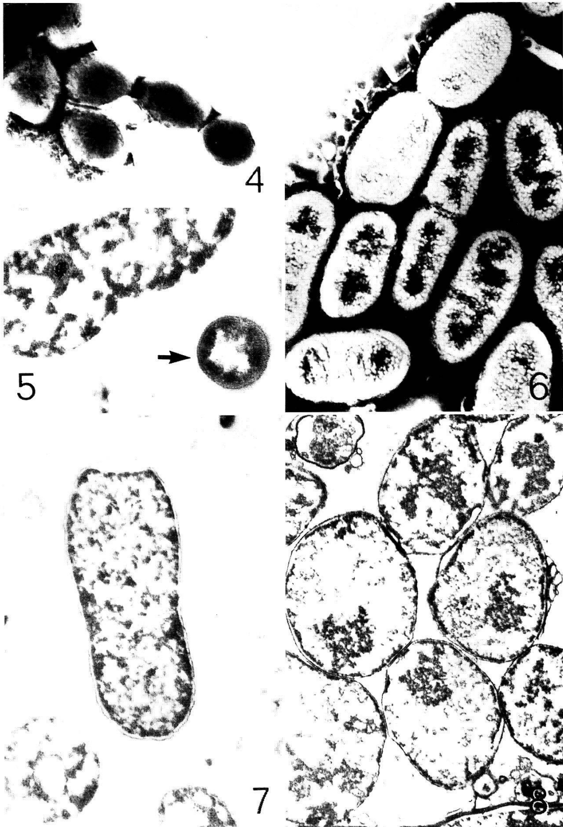
Fig. 4. Negatively stained preparation of small micro-organisms in a culture of symbionts isolated from a control fly (20,520 \times ).