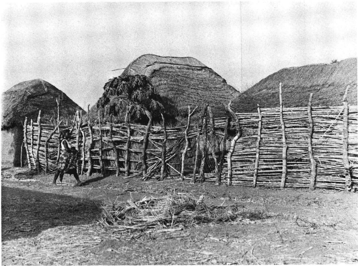
Fig. 2. A typical traditional house, in fishing, host or cash compensation villages.

yaws in Wawa and Mago while guineaworm infestations are found in all locations except Ngaski, Wawa and Wara.