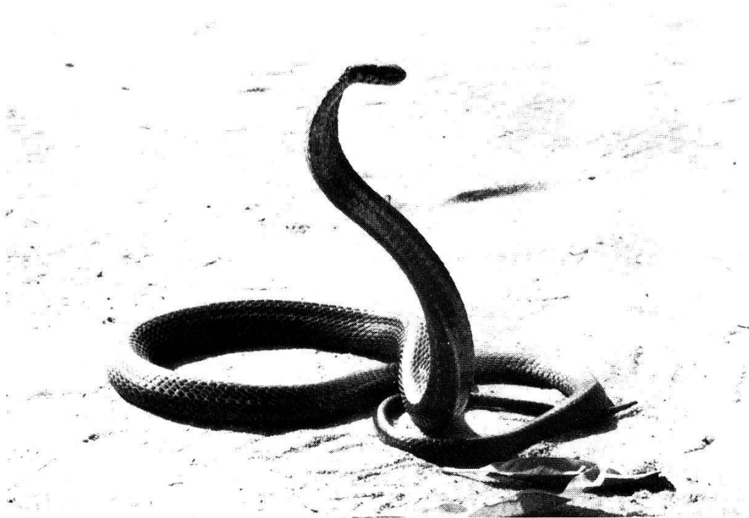
Fig. 3. Naja melanoleuca .

ber to April and a rainy season from May to October. According to the annual census of 1978 there were 44,547 registered inhabitants.