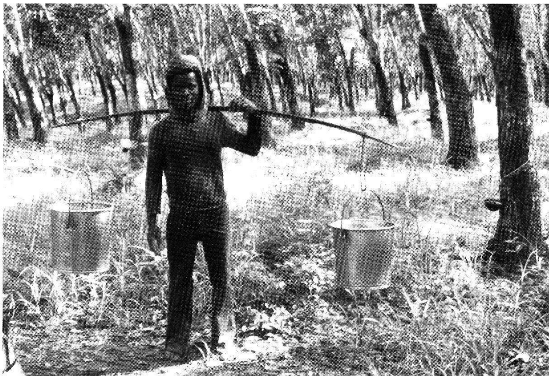
Fig. 4. A tapper on the plantation.