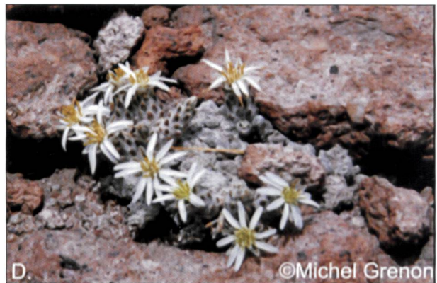
The genus Oriastrum is found in the mid- to high elevation southern Andes, often scattered in remote locations. Thanks to the generosity of numerous photographers this research was able to use superb images of species to further understand the variation and evolution in these high-elevation dwarf Asteraceae from the Chilean and Argentinian Andes. A. O. gnaphalioides (Paso Agua Negra, Coquimbo). B. O. abbreviatum (Calchaquies, Tucumán, Argentina). C. O. lycopodioides (Valle Nevado, Santiago). D. O. revolutum (Paso de Jama, Antofagasta).