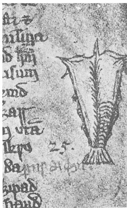
Fig. 1 Codfish as shown in the Stockholm Book.