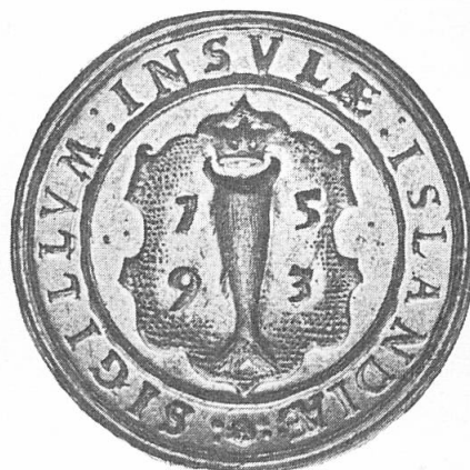
Fig. 2. Seal of 1593.

Council, that exercised royal powers during the minority of Christian IV, various matters, including the granting of a seal to the country. The seal was to be kept by the governor and used on missives to the king. The State Council granted the request, and there is a letter to the governor on the subject, dated 9th May 1593, where it is declared that the Council has acceded to the request of the Icelanders and had a seal made for them, which it has handed over to the governor of Iceland, Heinrich Chrag, and moreover commissioned him to keep it and see that it be not misused.