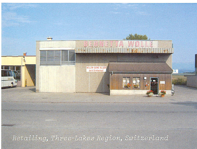
Retailing, Three-Lakes Region, Switzerland