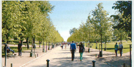
Lime tree path in the Kaivopuisto park, Helsinki, with «Tregator» water management, a system coming from England.