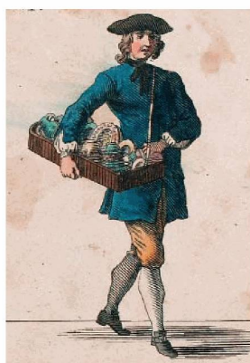
BLATTEN KRAMEN, BLATTEN. VOLFEL, THERGSCHIR, CHRUSLIEN Ich hab zwar Schin und fein Geschir, Wemms aber bricht, wer kan dafür?