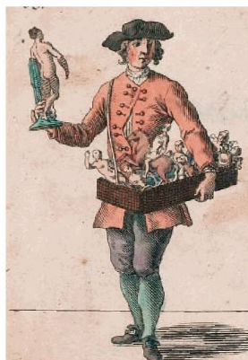
WER WIL SCHÖNE GIPS-BILDER KRAHMEN? Was fehlt den Bildern? sag es doch: Nichts, als das Leben mangelt noch

BERTHOUD, Ferdinand : Les longitudes par la mesure du temps, ou, Méthode pour déterminer les longitudes en mer, avec le secours des horloges marines : suivie du recueil des tables nécessaires au pilote pour réduire les observations relatives à la longitude & à la latitude. – A Paris : chez J.B.G. Musier fils, 1775. – IV, 90, 34 p., [1] f. de pl. dépl. ; 26 cm