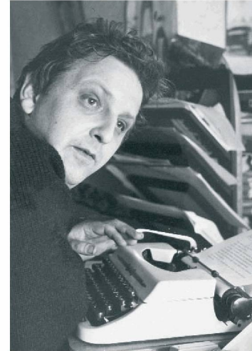
Peter Bichsel