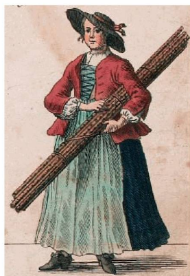
MÜNDER KEY LANG STEKE HAI Hier sind zu kauft lange stecken, beziert mit knorren u. mit stecken.