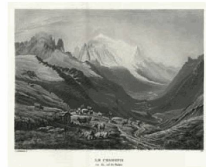
The NB is a partner in the project ViaticAlpes. Les images des Alpes dans les récits de voyage de la Renaissance au XIX e siècle ('The image of the Alps in travel writing from the Renaissance to the 19 th century'; www.unil.ch/viaticAlpes ).

The NL made a big step forward in digitisation. In addition to the above-mentioned platform Digicoord , the digitisation of newspapers was in the foreground. In French-speaking Switzerland thanks to a general agreement with Presse Suisse the digitisation of newspapers could be officialised. The NL takes part in newspaper digitisation projects in which the publisher and a cantonal or local library are also partners. The first such endeavour being handled according to this principle was the Journal de Genève . Since December 2008 it has been available online free-of-charge. 10 The publisher Le Temps was responsible for project management and a further project partner was the Bibliothèque de Genève. In addition to financial support, the NL made its expert knowledge and experience available. Agreements for the digitisation of the Gazette de Lausanne as well as the Neuchâtel newspapers L'Express and L'Impartial have been signed during the year under review.