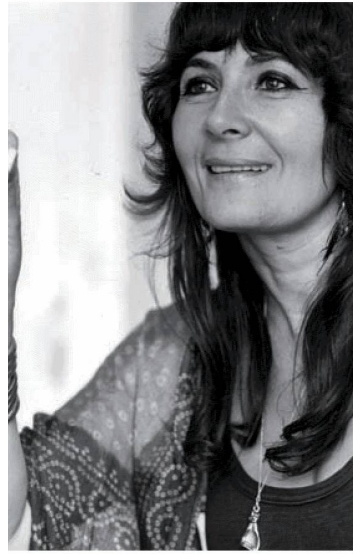
Grisélidis Réal, All rights reserved

RÉAL, Grisélidis (1929–2005): Complete estate with manuscripts of works, correspondence, photographs, visual works, articles and documents concerning her commitment to the rights of prostitutes. Réal's collection of works and documentation about prostitution is held in the Centre Grisélidis Réal in Geneva.