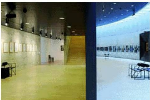
Caricatures: Bosc, Chaval, Sempé et Ungerer exhibition

The philosophical works in Friedrich Dürrenmatt's library, some 3000 volumes, were catalogued as part of the 'authors' libraries' project. Each book is described in HelveticArchives , its bibliographic information often accompanied by photographs of significant pages from the volume in question.