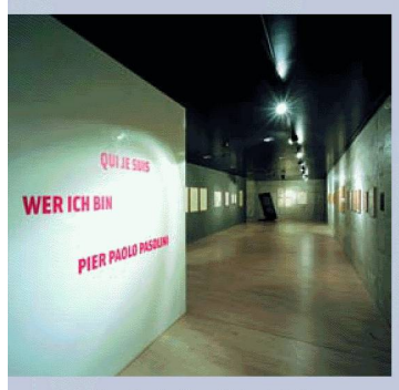
Pier Paolo Pasolini exhibition