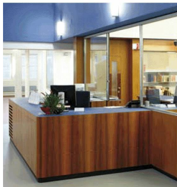
The redesigned public areas at the NL: Information desk

Many of the NL's holdings have been rendered more accessible: newspapers on microfilm may be consulted without pre-registration or ordering, and reference-only shelves have been arranged according to the subjects "Swiss history", "Swiss literatures", "Swiss art and architecture" and "Information science", in addition to being enhanced with additional stock.