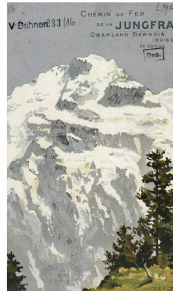
Reading Europe exhibition: prospectus for the Jungfrau Railways, 1903

The Centre Dürrenmatt Neuchâtel's exhibition Günter Grass – Bestiarium and the celebration held to mark its tenth anniversary made for a massive increase in visitor numbers, with 12 164 guests in 2010 (2009: 9784). The series of tenth-anniversary events began with a ceremony on 25 September and continues into 2011. 12