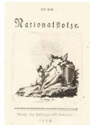
Johann Georg Zimmermann