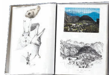
Sketchbook by Hans Witschi

WITSCHI, Hans, Skizzenbuch 1985–1987 , 1 volume, 1985–1987.