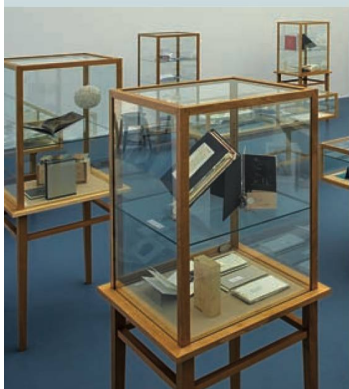
Unikat – Unikum, 22.11.2014– 28.2.2015