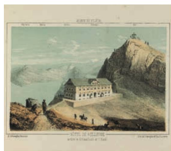
Hôtel Bellevue entre le Kriesloch et l'Esel, in: Album du Pilâte: collection de 10 vues du Pilâte et de ses environs accompagnée d'un panorama , dess. d'après nature et lith. par Xaver Schwegler, Lucerne: Schwegler & fils, around 1865

canton of St. Gallen, from which eight titles from the 19th century were made accessible, as well as La Sentinelle (1890–1971), from the canton of Neuchâtel. Accessing of newspapers digitised by the NL rose more than fivefold compared with the previous year (2013: 15 114; 2014: 83 549). 25