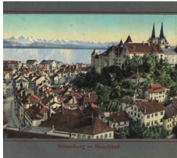
Vue de Neuchâtel, in: Die Schweiz = La Suisse , Neuchâtel, Maison Timothée Jacot, W. Bous, around 1900