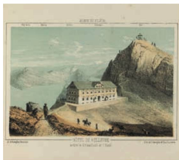
Hôtel Bellevue entre le Kriesiloch et l'Esél, in: Album du Pilâte: collection de 10 vues du Pilâte et de ses environs accompagnée d'un panorama , dess. d'après nature et lith. par Xaver Schwegler, Lucerne: Schwegler & fils, around 1865

canton of St. Gallen, from which eight titles from the 19th century were made accessible, as well as La Sentinelle (1890–1971), from the canton of Neuchâtel. Accessing of newspapers digitised by the NL rose more than fivefold compared with the previous year (2013: 15 114; 2014: 83 549). 25