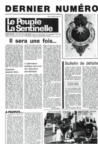
Front page of the last issue of Le Peuple La Sentinelle , Neuchâtel-Jura edition, 19 th May 1975