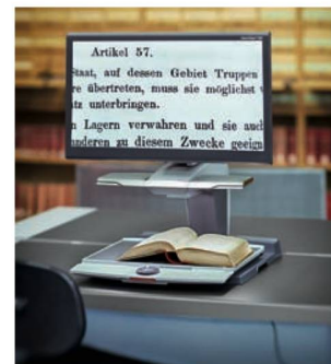
Workstation for the visually impaired

Other platforms that receive materials from the NL include swisspressarchives.ch 23 for newspapers and retro.seals.ch 24 for journals. The former now also contains newspapers from the