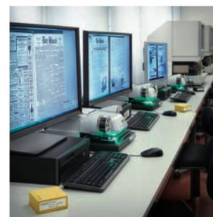
New microfilm scanners