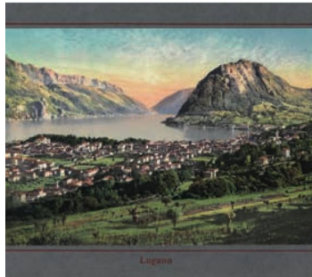
Vue de Lugano, in: Die Schweiz = La Suisse , Neuchâtel, Maison Timothée Jacot, W. Bous, around 1900